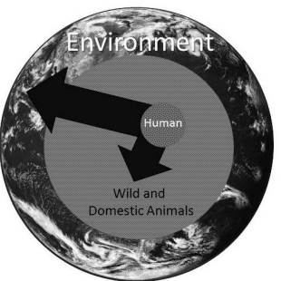
e) Concentric circles